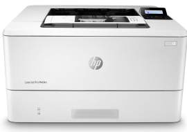
HP LaserJet Pro M404n

Winning in business means working smarter. The HP LaserJet Pro M404 printer is designed to let you focus your time where it's most effective--helping to grow your business and staying ahead of the competition.