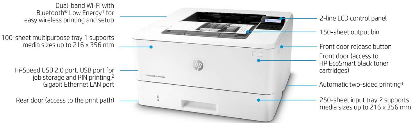
HP LaserJet Pro M404dw