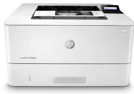
HP LaserJet Pro M404dn