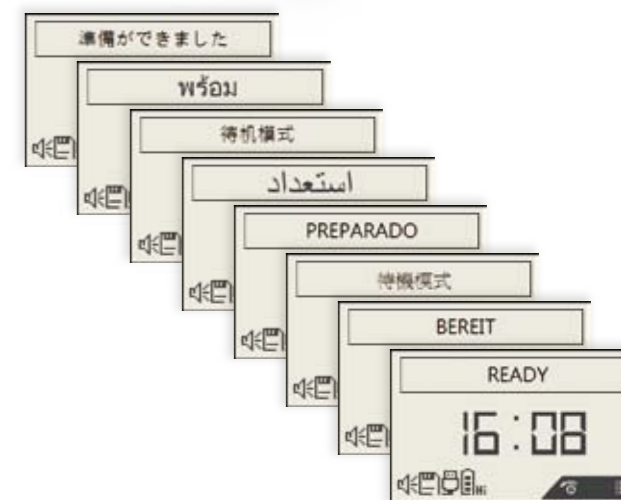
Multilingual LCD Display