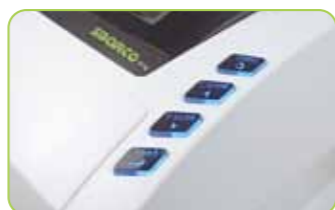
4 function buttons + flash indication