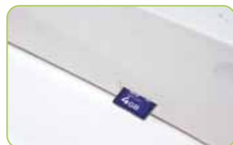
SD card Slot (Up to 4GB)