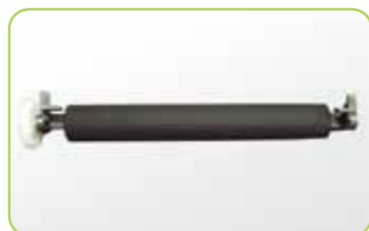
Easy Roller Replacement