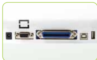
Full communication ports