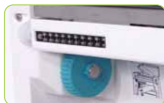
See-through sensor (Auto Detection)